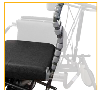
Concave back for gluteal shelf improves user support & dignity