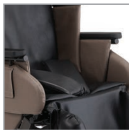
Padded Thigh Strap