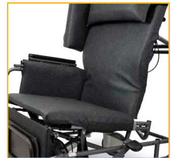
Swing Away, Removable Arm Supports facilitate side-transfers