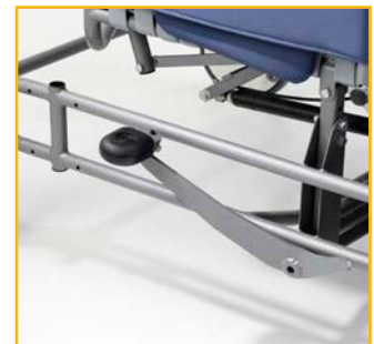
Manual foot pump allows safe, no lift tilt positioning