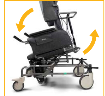
Anterior and posterior tilt aids in safe patient handling