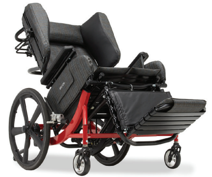
Front-pivot seat tilt maintains a forward line of sight, enhancing engagement.