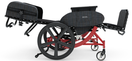
Tilt and recline functionality provide pressure offloading.