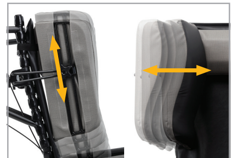
Adjustable upper lateral supports fit a variety of users.