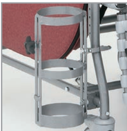
O 2 Holder