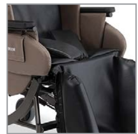
Padded Thigh Strap