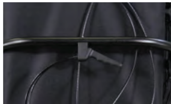
Hand brake for quick and easy stopping on ramps.