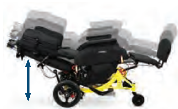
Elevating seat surface height makes transfers easy and safe, raising from 22.5" to 32".