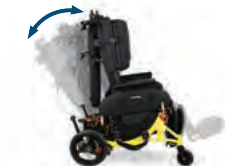
Adjustable seat tilt makes for a comfortable trip by relieving painful pressure points.