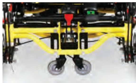
Maneuver laterally in tight spaces with our proprietary Pivot Assist System™.